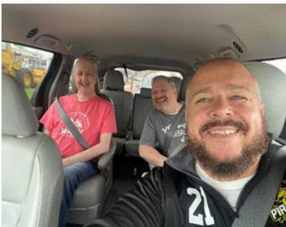
En route to Raymour & Flannigan to pick out new furniture!