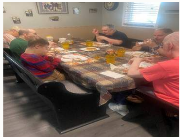
Enjoying some delicious Saturday morning breakfast